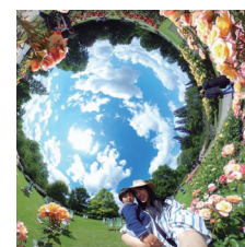
360° image taken with RICOH THETA