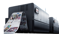
RICOH Pro VC70000