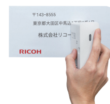
RICOH Handy Printer