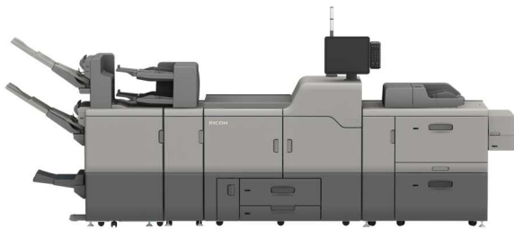
RICOH Pro C7210 with options (including Booklet Finisher SR5120, Cover Interpose Tray CI5040)