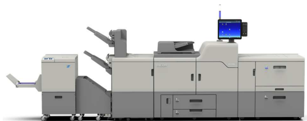
RICOH Pro C7210 with options (including Booklet Finisher SR5120, Plockmatic Face SquareBack Trimmer for SR5120)