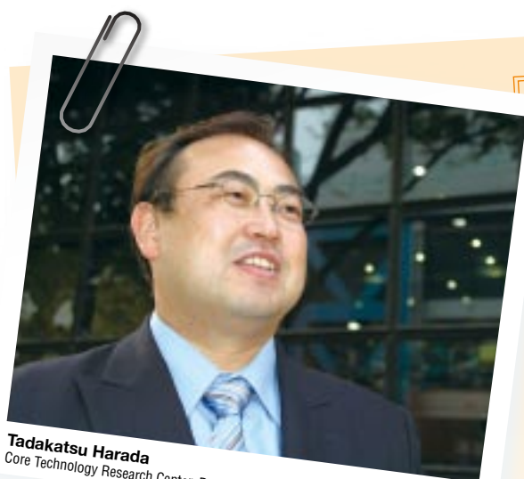
Tadakatsu Harada Core Technology Research Center, Research and Development Group

Because there were various technical hurdles in putting plant-based plastic into practical use, we went through the process of trial and error repeatedly to determine the right raw material as well as to raise the percentage of the material used. We spent three years improving the material to meet safety standards and achieve a recycling function before putting the new plastic to practical applications. Manufacturers are responsible for selecting materials used in their products. I think we must take the initiative in using new environmentally-friendly materials, thus contributing to improving society. When we think about the oil depletion issue, making product materials using raw materials (plants) that can be grown in the cycle of nature is a good thing. Plant-based plastic is merely the first step. Now, we have to continue with the second and third steps.