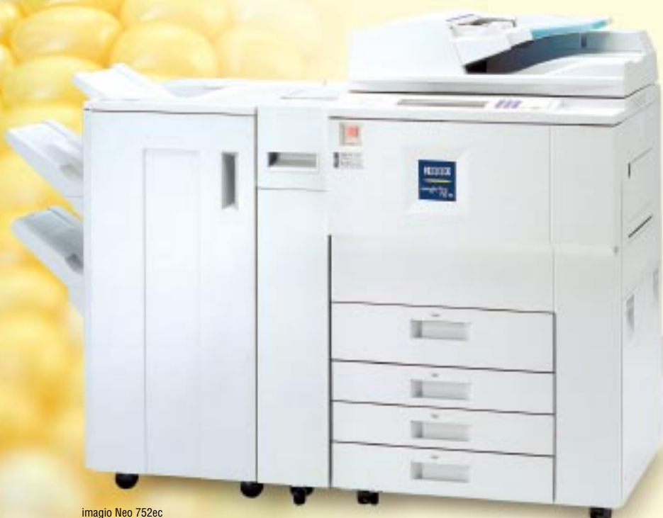
imagio Neo 752ec "imagio" is the brand name used in Japan.

We try to achieve the practical application of materials with less environmental burden to replace oil.