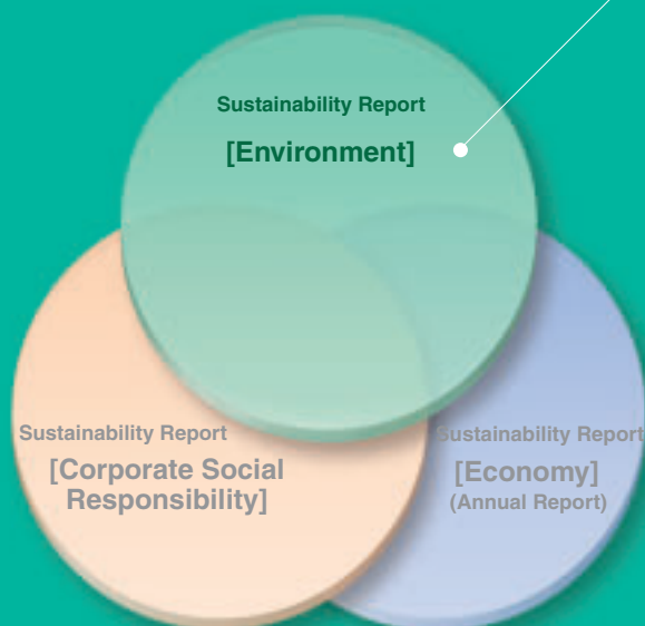
Sustainability Report (Environment) and Other Reports