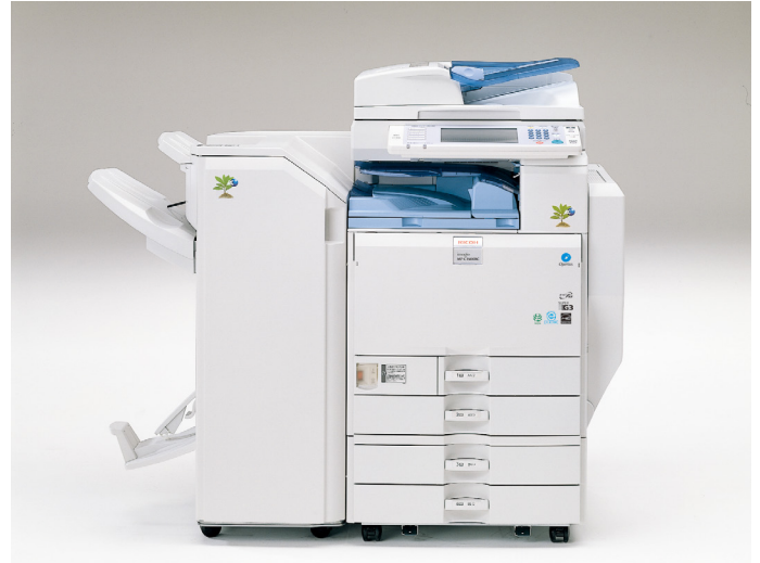
imagio MP C3500RC

*Products wholly composed of newly manufactured parts or like-new products containing some remanufactured parts