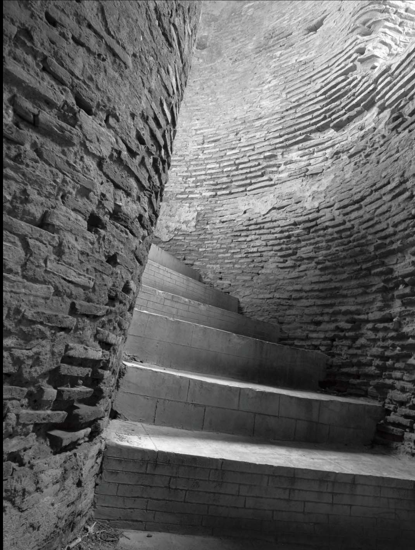
With use of 21mm wide conversion lens (GW-1), 1/5sec, F5, ISO100, EV-0.5, WB:MANUAL, Full size photo; no trimming