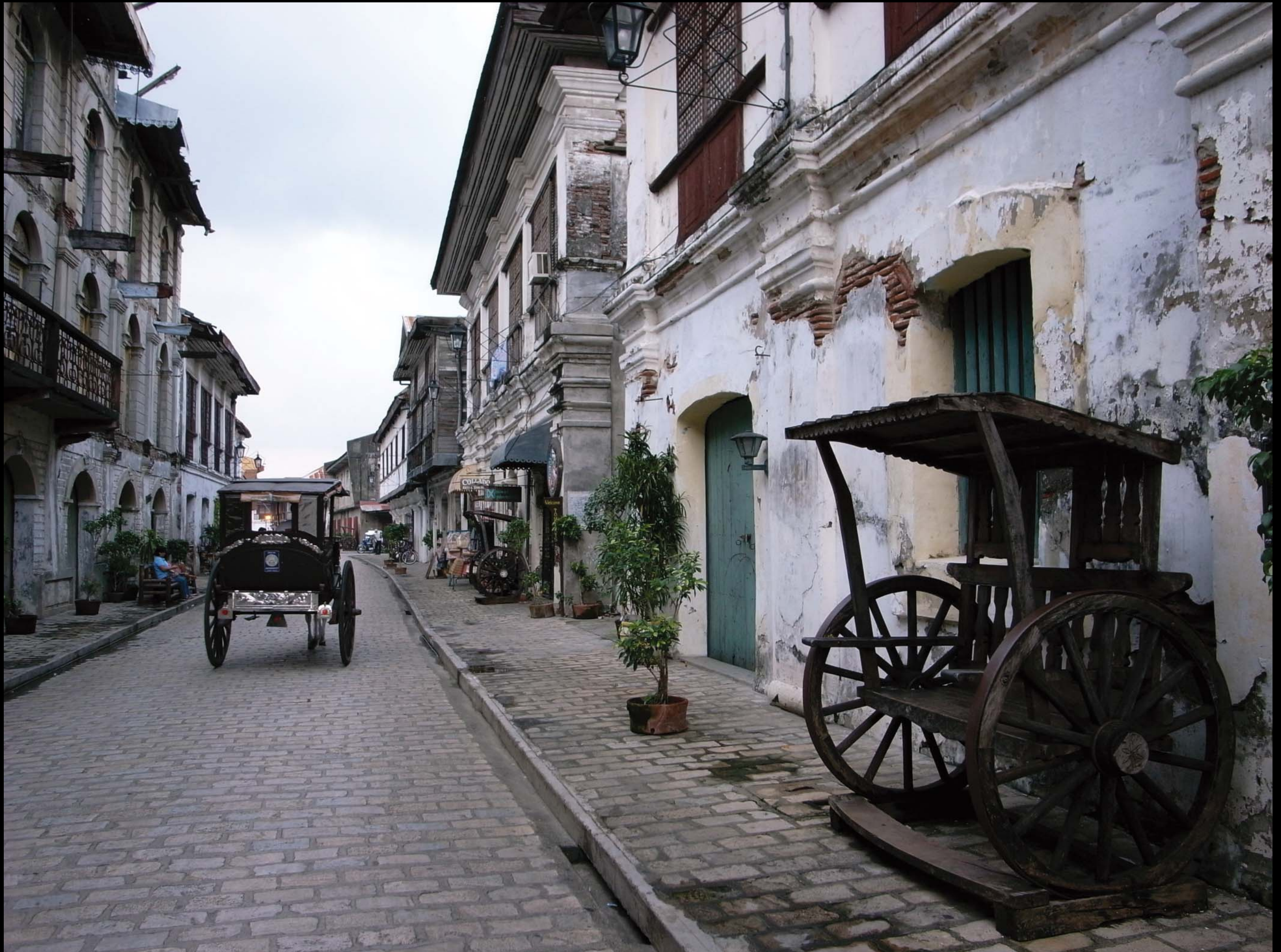
1/40sec, F2.4, ISO100, WB:AUTO, Noise Reduction: ON, Full size photo; no trimming