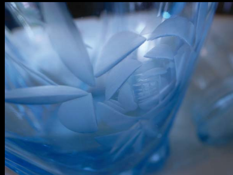
1/8sec, F2.4, ISO100, EV-0.7, WB:MANUAL, Noise Reduction: ON, Full size photo; no trimming