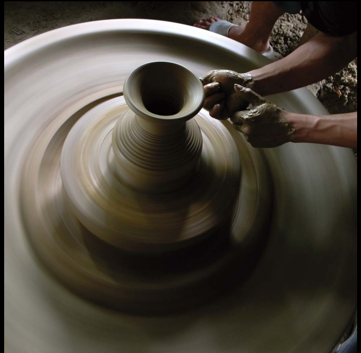
1/6sec, F2.4, ISO100, EV-0.7, WB:MANUAL, Full size photo; no trimming