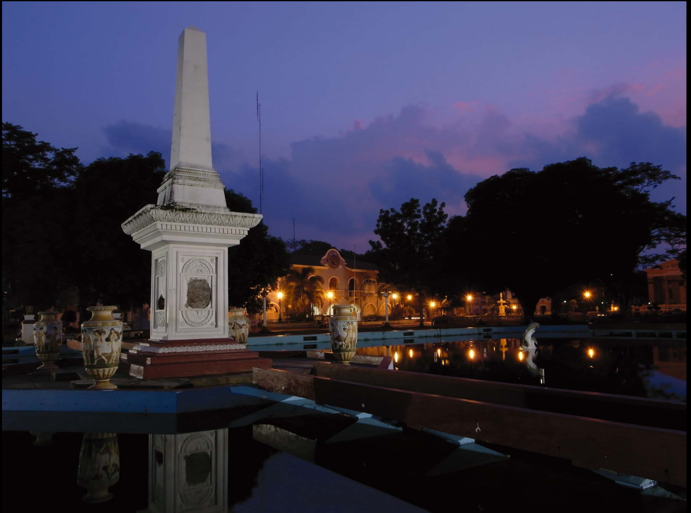
1sec, F5, ISO100, EV-0.8, WB:MANUAL, Noise Reduction: ON, Full size photo; no trimming