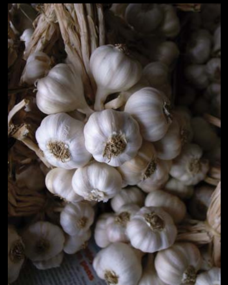
1/80sec, F2.4, ISO100, EV-0.7, WB:AUTO, Full size photo; no trimming