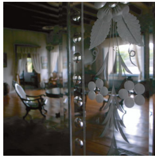
1/40sec, F2.4, ISO100, EV-1.5, WB:AUTO, Noise Reduction: ON, Full size photo; no trimming

GR DIGITAL II not only frames images in 4:3 and 3:2 aspect ratios, but also features a square setting that emulates 6 X 6 medium format cameras — giving you the means of creating distinctive square shots. And these square images can also be captured in RAW mode.