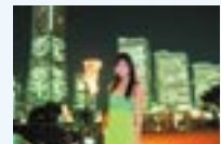
4. Nightscape For recording people at night.