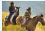
2. Sports For recording objects in motion.