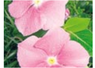
use the built-in flash