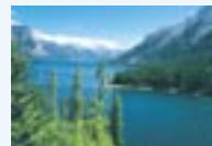
3. Landscape For recording landscapes with lots of greenery or blue sky.