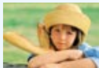
1. Portrait For recording people outdoors. Blurs background nicely.

The Caplio RR30 offers a choice of six preset scene modes – Portrait, Sports, Landscape, Nightscape, Text, and High-sensitivity – providing the best results in these specific situations.