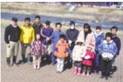
Cleaning Up Shiroishi River (Tohoku Ricoh Co., Ltd.) Shitaba-machi in Miyagi Prefecture is famous for its cherry blossoms and is designated as one of Japan's best 100 cherry blossom viewing spots. On March 19, 2004, Tohoku Ricoh employees and their families (a total of 14 people) took part in cleaning up Shiroishi River to prepare for the Shibata Cherry Blossom Festival.