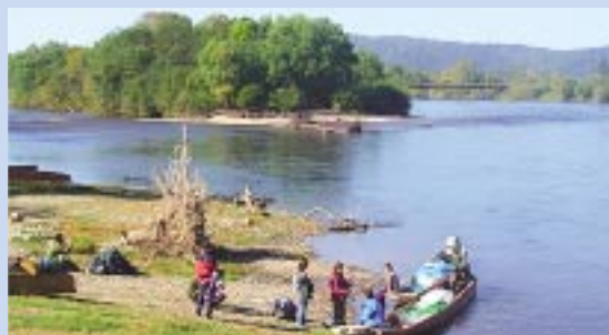
The Bikin River basin stretches over approximately 13,000 square kilometers, from Khabarovsk to Vladivostok, which is equivalent to the combined areas of Tokyo, Kanagawa, Chiba, and Saitama.