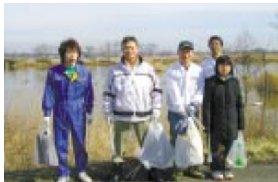
Cleaning Up the Izunuma/Uchinuma Wetlands (Hasama Ricoh) The Izunuma/Uchinuma Wetlands in Miyagi Prefecture, which are listed under the Ramsar Convention, are the winter home for swans and geese. On March 20, 2004, seven Hasama Ricoh employees volunteered to clean up the wetlands with other participants.