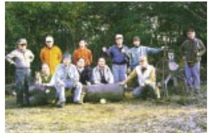
Conserving the Shishigaya Green Zone On February 5, 2004, 15 members of the Shishigaya Green Zone Conservation Group trimmed and cut plum trees and mended fences to conserve the landscape of the Shishigaya Green Zone in Yokohama City, Kanagawa Prefecture.