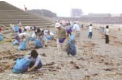
Cleaning Up Senbonhama Beach in Numazu (Ricoh Numazu Plant) On June 27, 2004, 25 Ricoh Numazu Plant employees volunteered to clean up Senbonhama Beach in the 2004 Festa Coste del Gomi in Senbonhama, Shizuoka Prefecture. About 800 people participated in the event and collected a large amount of garbage that was carefully disposed of.