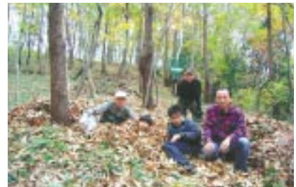
Thicket Conservation at Hatano City Five members of the Hatano Thicket Conservation Group cleared the fallen leaves in the thicket of Lake Shinsei on December 12, 2004.