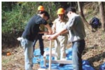
Conservation of the Satoyama Area of Mt. Satsuki (Ikeda Plant and Yashiro Plant) Ikeda Plant and Yashiro Plant employees and their families participated in activities to conserve the satoyama (community forest) area of Mt. Satsuki in Ikeda City, Osaka, on November 20, 2004. Two sets of tables and benches that were bought with the funds from Free Will, Ricoh's social contribution club, were installed on the observation deck.