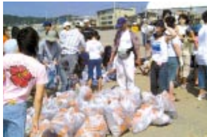
Cleaning Up the Beach at Kamakura On September 19, 2004, 115 Ricoh Group employees and their families cleaned Zaimokuza beach in Kamakura and enjoyed making sand sculptures.