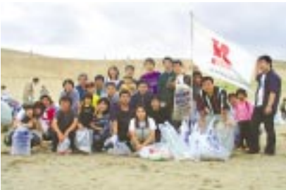
Cleaning Up the Tottori Sand Dunes (Ricoh Tottori Group) On September 26, 2004, 90 Ricoh Tottori Group employees took part in cleaning up the Tottori Sand Dunes, a national park. Thanks to this program, which takes place annually, the amount of garbage that litters the area is decreasing each year.