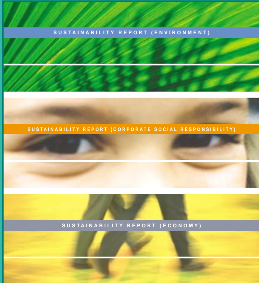
Sustainability Report (Environment) and Other Reports