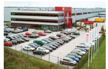
Exterior view of European Distribution Center