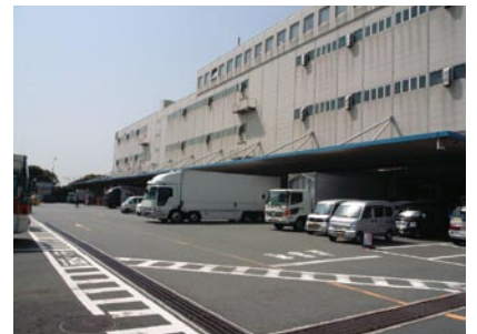
■ Keihinjima Logistics Center

To respond to this challenge, the Group has formulated a set of basic rules to address risks likely to arise in the course of duties, and this initiative has been further supplemented by the identification of employees, mutual reminding, patrolling, storing of customers' items in locked places and other measures. For greater information security, Ricoh Logistics makes sure that a uniform level of security is achieved across the Group and that the basic rules are fully enforced.