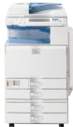
The imagio MP C3000 with optional equipment

* Color universal design certification has been verified for the entire operation board, excluding monochrome LCDs.