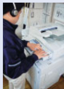
"Copier equipped" with a "voice navigation" function located in the teachers' lounge

dents larger. I hope that more functions can be used through voice navigation, including that for reproducing data stored in the copier, when necessary. It may be difficult due to profitability reasons, but efforts to realize "ease of use" to help normalize the lives of the physically challenged are greatly appreciated. I believe that such efforts will help people like us become more independent."