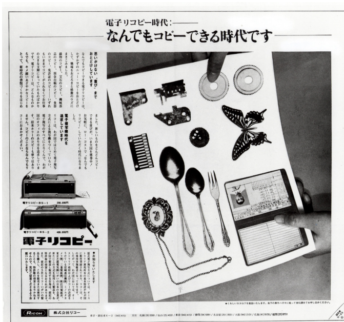
Campaign advertisement for Ricopy (1965)