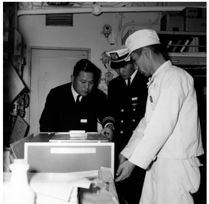
Ricopy BS-1 installed on the Fuji Antarctic researchship (1966)