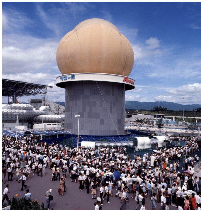
Ricoh Pavilion welcomed many visitors every day

In 1970, Japan Expo '70, the first world's fair in Asia, was held in Osaka over 183 days starting from March 15. Ricoh participated in the event by setting up a pavilion, which was created fully utilizing its technological achievements and in line with the exposition's overall theme of "Progress and Harmony for Mankind." Our extraordinary exhibition feature a host of unique ideas that impressed many visitors and attracted a total of more than 7 million people at the Ricoh pavilion over the entire period.