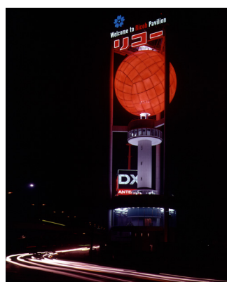
Ricoh's billboard tower became famous in Toyonaka City, Osaka